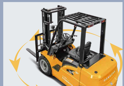
Turning radius reduced