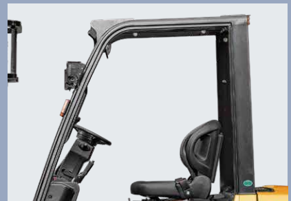
Ergonomically designed forklift enables a wide view