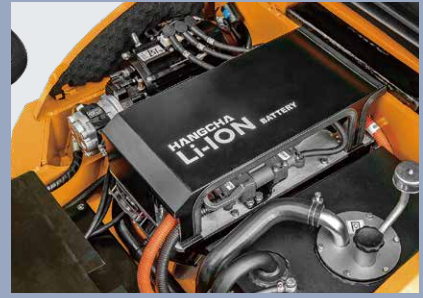
Double permanent magnet synchronous motor system