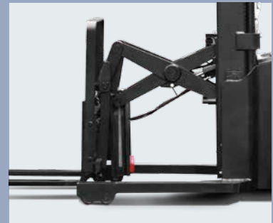
Forks move forward by the scissor structure