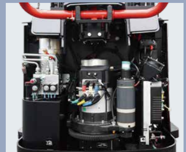
Back cover can be opened fully