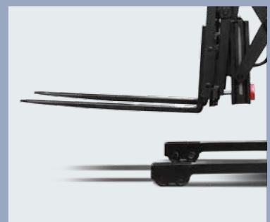
Proportional controlled forks can be operated more accurately